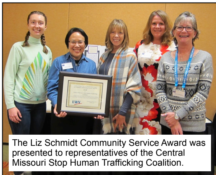
The Liz Schmidt Community Service Award was presented to representatives of the Central Missouri Stop Human Trafficking Coalition.