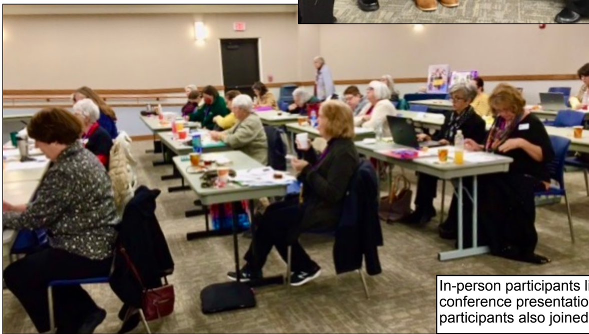
In-person participants listen to a conference presentation. Some participants also joined via Zoom.