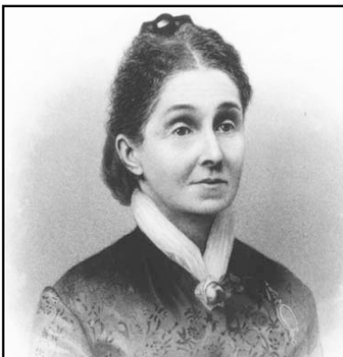
Virginia Minor, 1824-1894