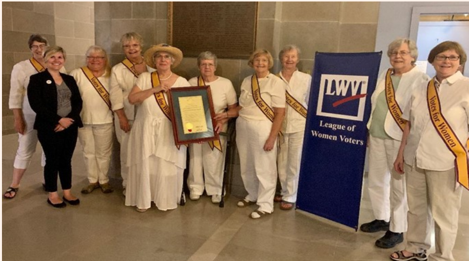
Proclamation Ceremony, July 8, 2019, commemorating the Centennial of Missouri's ratification of the 19th Amendment.

Jay Ashcroft, secretary of state, presented the proclamation.