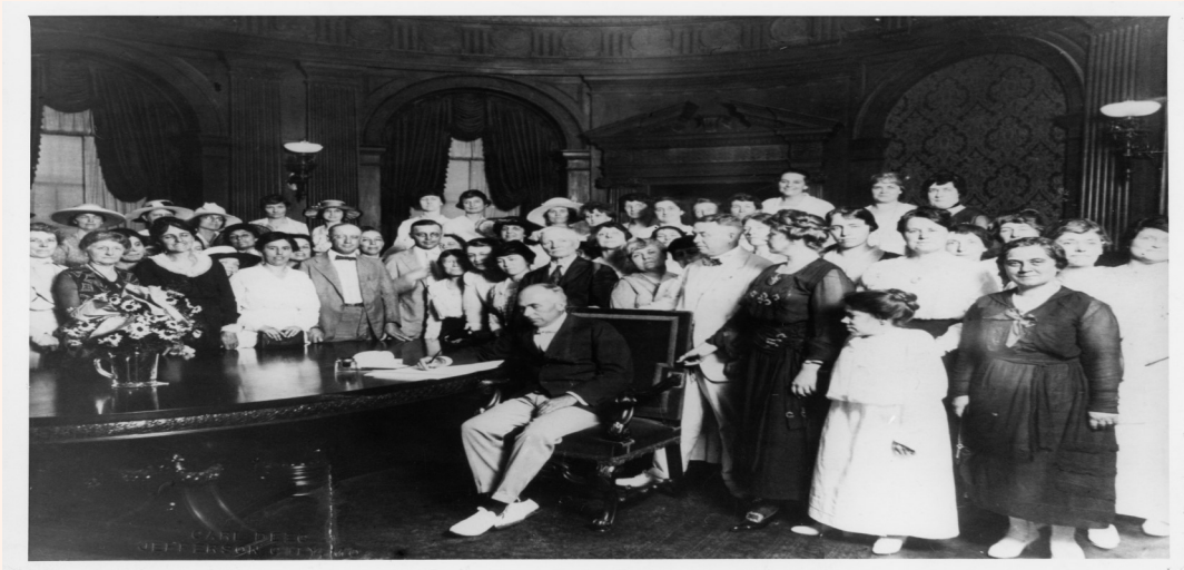
Governor Gardner signing Missouri's ratification of the 19th Amendment on July 3, 1919.